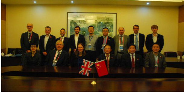
CRTDC, British Embassy, Innovate UK and representatives from the Agri-tech Centres

Around 55 representatives from British companies, universities and government spent last week in China to discuss collaboration in agri-tech innovation.