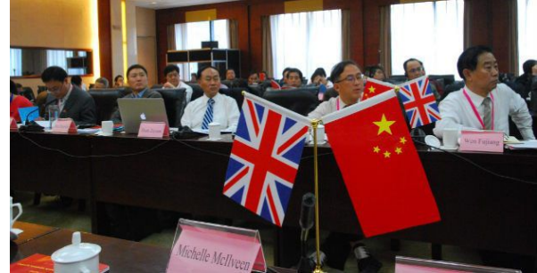
Part of the Chinese delegation at the Innovation Policy Roundtable